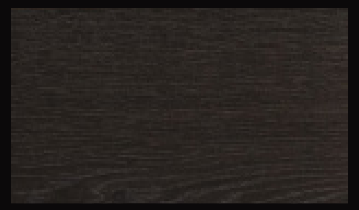
WHITE OAK RAROTONGA