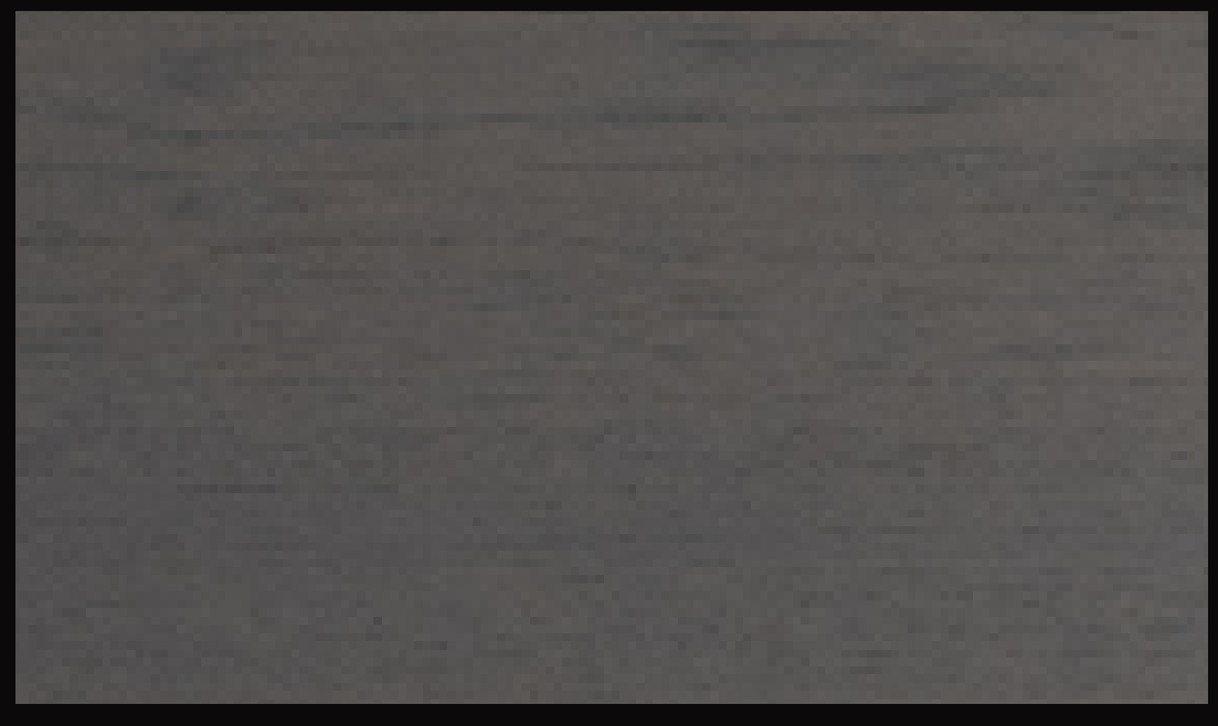
WHITE OAK RAGLAN