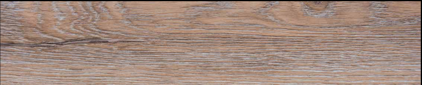
Mission District W010