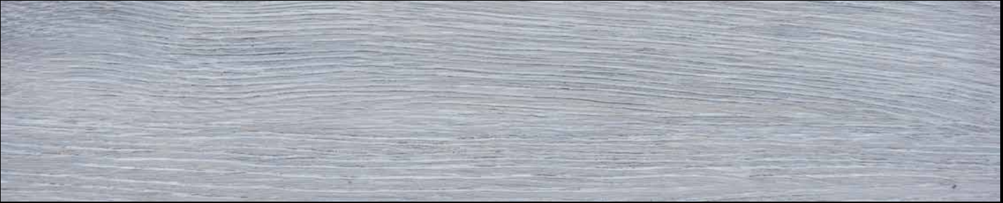
Echo Park W077