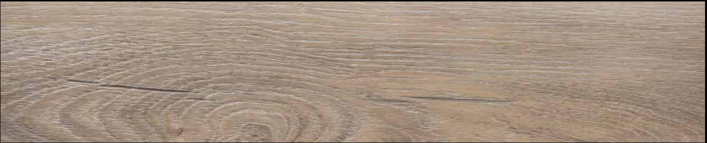
West Loop W072