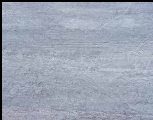
14th Street S014