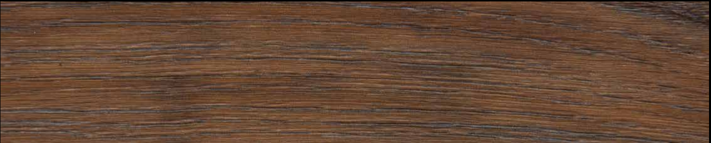
North End W069