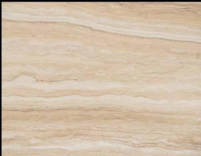
Thames Street S214