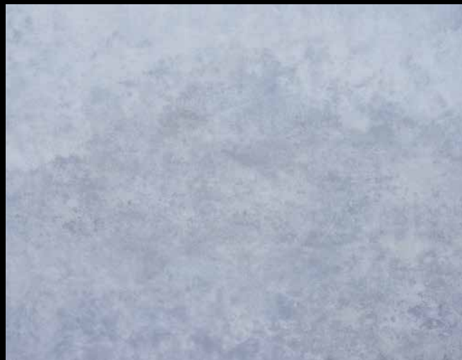
Ocean Drive L419