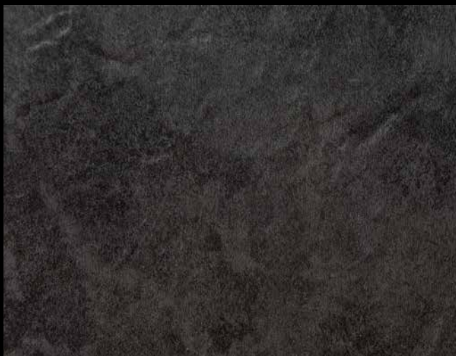
South Street L033