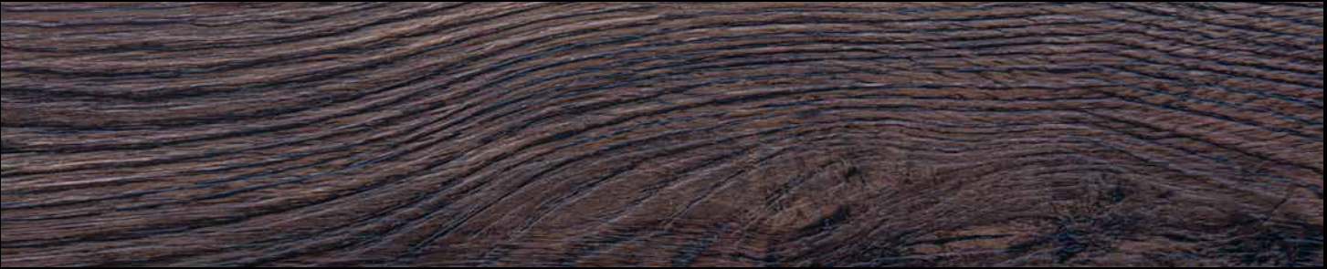
Adams Morgan W093