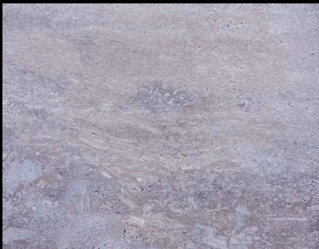
U Street S328