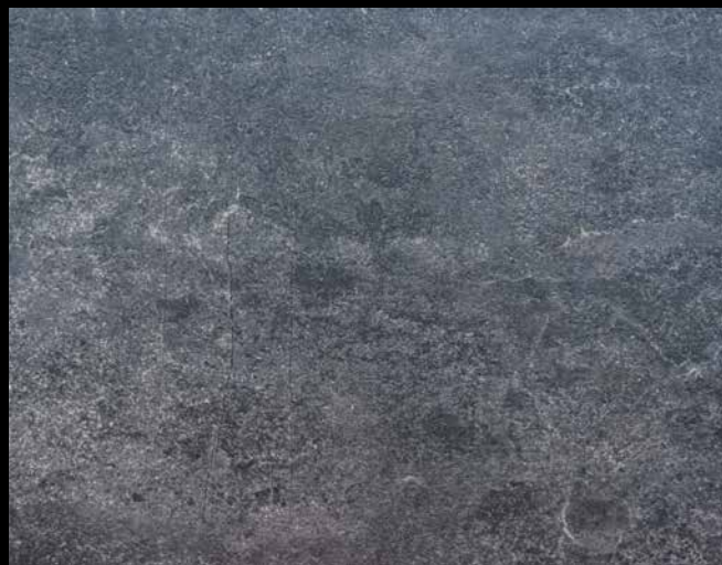
Madison Avenue S408